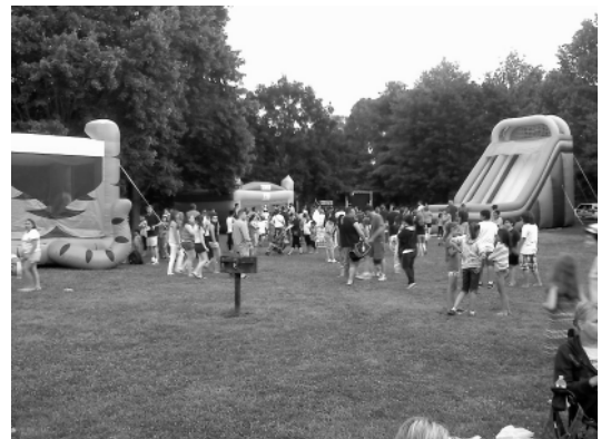
Residents gathered for the Township annual Independence Day Celebration. Participants enjoyed an evening of music, games and food. The event concluded with a spectacular fireworks display.

Local business owners who would like to become a community partner can contact the Recreation Department at 443-4000 ext. 225.